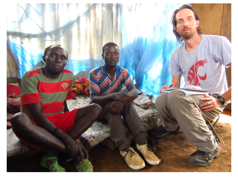
Conducting interviews with the Chabu of Ethiopia.