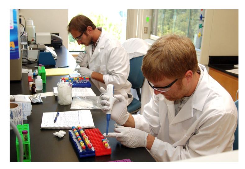
Analyzing nicotine metabolites in saliva from Congo Basin hunter-gatherers.